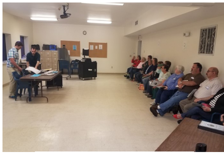
Election Workers are on the front lines of Democracy

On General Election Day, more than 300 election workers are needed to serve the voters of St. Lawrence County. This presents a great opportunity to serve your community and be a part of the election process. You may join the team by completing the election worker form on the reverse side: mail, fax or email it, or you may also call or visit our office in Canton.