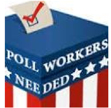
St. Lawrence County Board of Elections